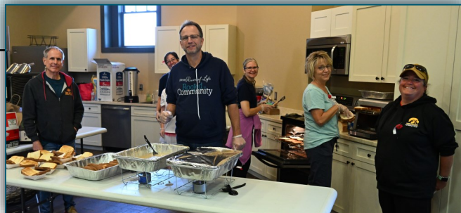
Pictured: Johnston River of Life Church